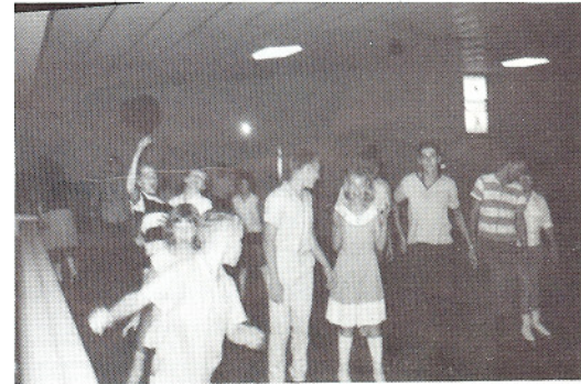
Roll on! Roll on!

Smiling faces September 5, marked another eventful day for the Wichita youth as they gathered at Skateland Roller Rink for a skating party. The skaters participated in a grand march, under the bar contest as well as special trio and couple skating. Many took home reminders of their experience in the traditional colors of black and blue — something they are sure to remember for some time. Whether a beginner or an "Old Pro" it was enjoyed by all!