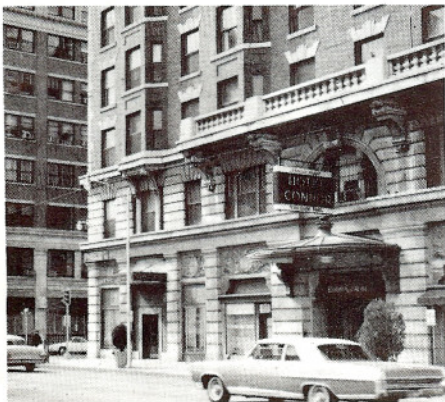
The Connor Hotel